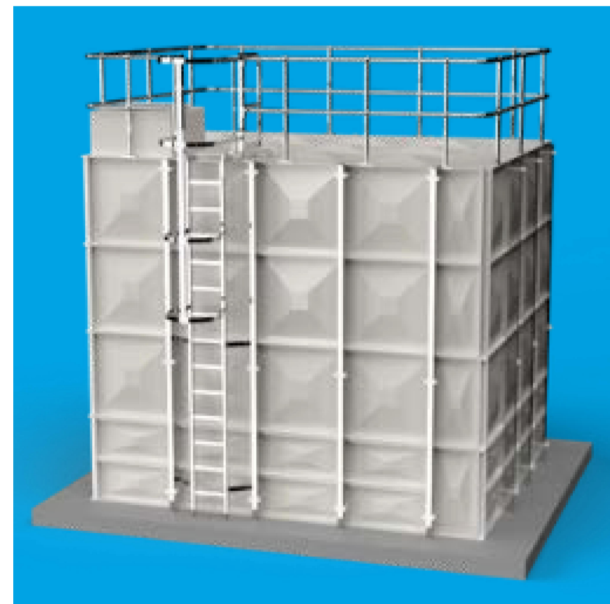
TYPICAL GRP SECTIONAL COLD WATER STORAGE TANK